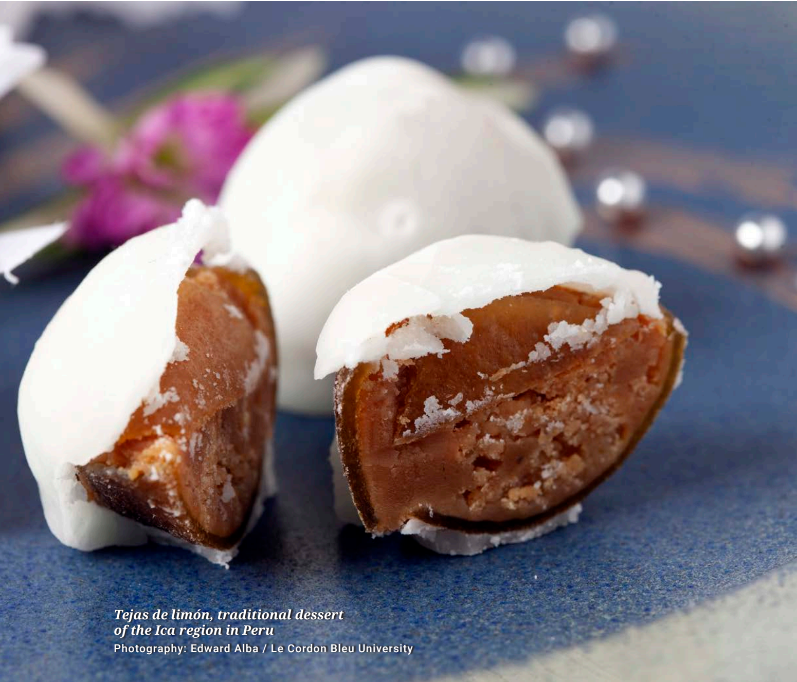
Tejas de limón, traditional dessert of the Ica region in Peru